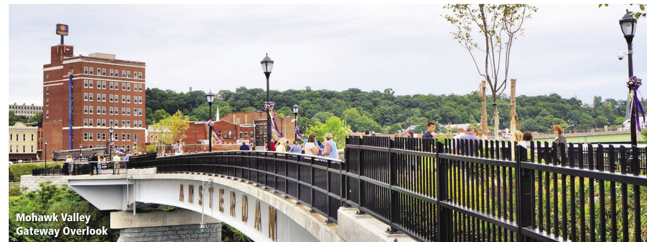
Mohawk Valley Gateway Overlook