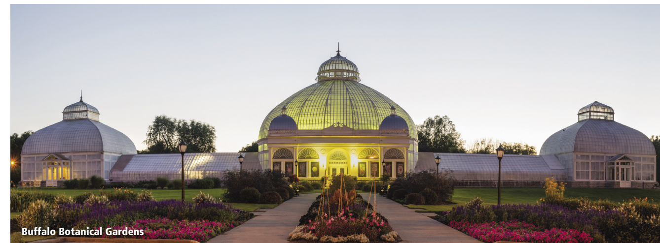
Buffalo Botanical Gardens