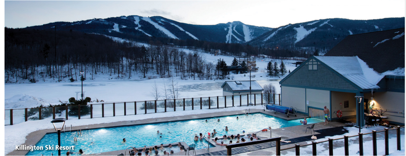
Killington Ski Resort