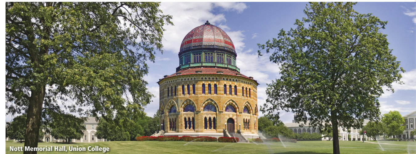
Nott Memorial Hall, Union College