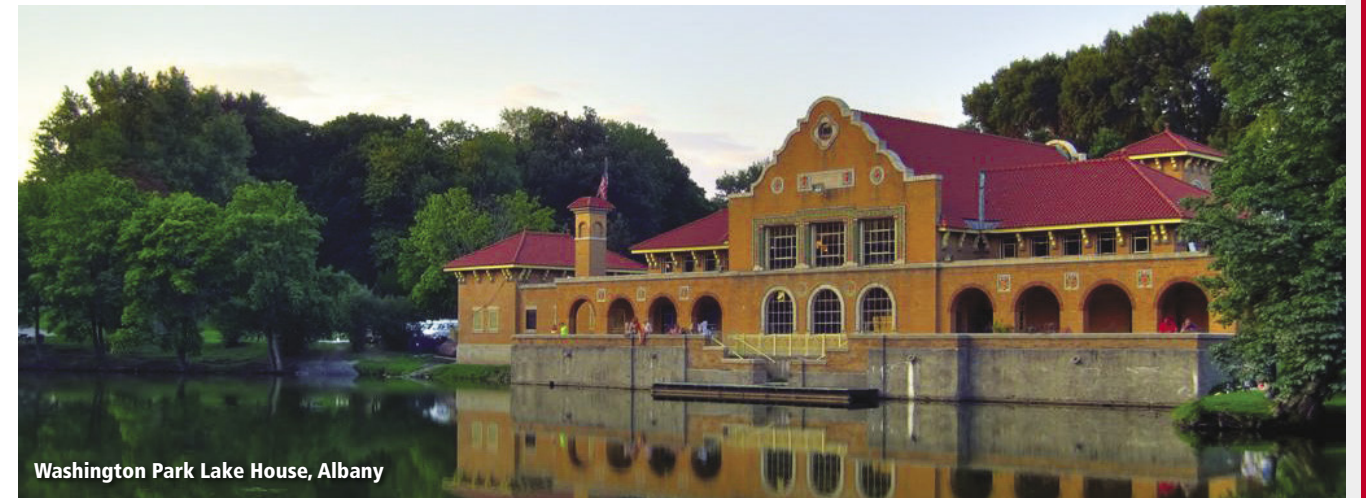
Washington Park Lake House, Albany