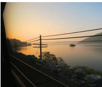
Hudson River from train, in the morning, south of Bear Mountain Bridge.