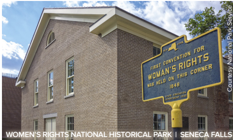
WOMEN'S RIGHTS NATIONAL HISTORICAL PARK | SENECA FALLS

Finger Lakes, Central NY, Capital-Saratoga