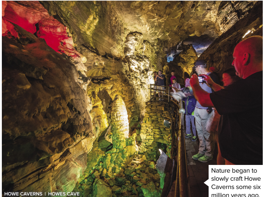
HOWE CAVERNS | HOWES CAVE

Nature began to slowly craft Howe Caverns some six million years ago.