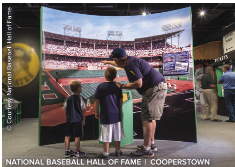
NATIONAL BASEBALL HALL OF FAME | COOPERSTOWN