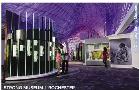
STRONG MUSEUM | ROCHESTER