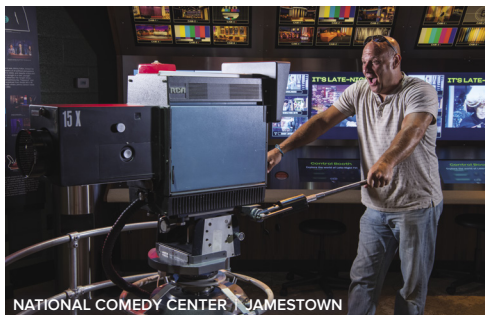
NATIONAL COMEDY CENTER | JAMESTOWN

Chautauqua-Allegheny, Greater Niagara, Finger Lakes, 1000 Islands