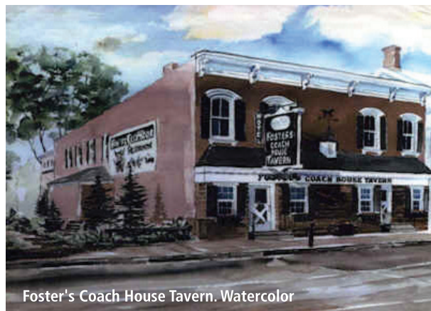
Foster's Coach House Tavern. Watercolor

a variety of events from May to October, bringing in people from all over the country as vendors and participants. What do they all have in common? Why, it's the thought which goes into who vends and shows there that keeps the quality high and leaves these as not to be missed. The same can be said for the local merchants. Porchfest, music on the porches of old Victorian homes, might bring you deeper