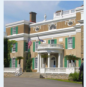
Franklin D. Roosevelt Estate