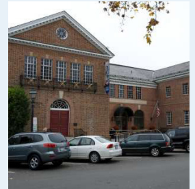
Baseball Hall of Fame