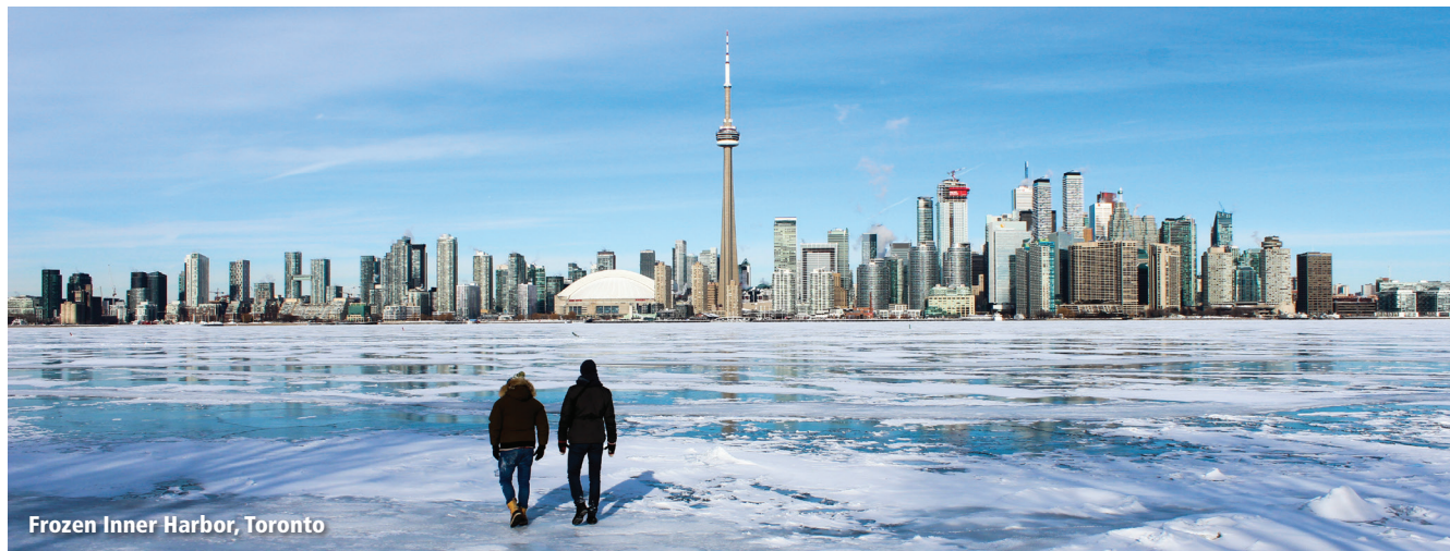
Frozen Inner Harbor, Toronto